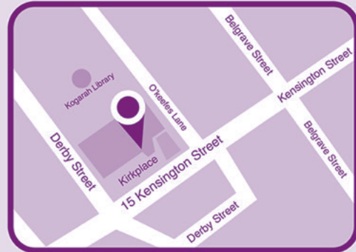
Recovery & Wellbeing College & Keeping the Body in Mind Gym - (02) 9113 2981 Unit 2, Ground Floor, Kirk Place, 15 Kensington Street, Kogarah NSW 2217. Wheelchair accessible