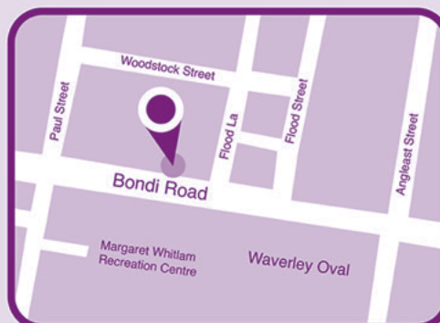
Sydney East Community College - (02) 9387 7400 98 Bondi Road, Bondi Junction NSW 2022. Wheelchair accessible