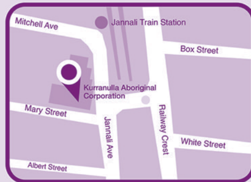
Kurranulla Aboriginal Corporation - (02) 9528 0287 15 Jannali Avenue, Jannali NSW 2226. Wheelchair accessible