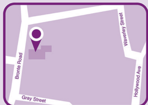
headspace, Bondi Junction - (02) 9366 8800 20 Bronte Road, Bondi Junction NSW 2022. Wheelchair accessible